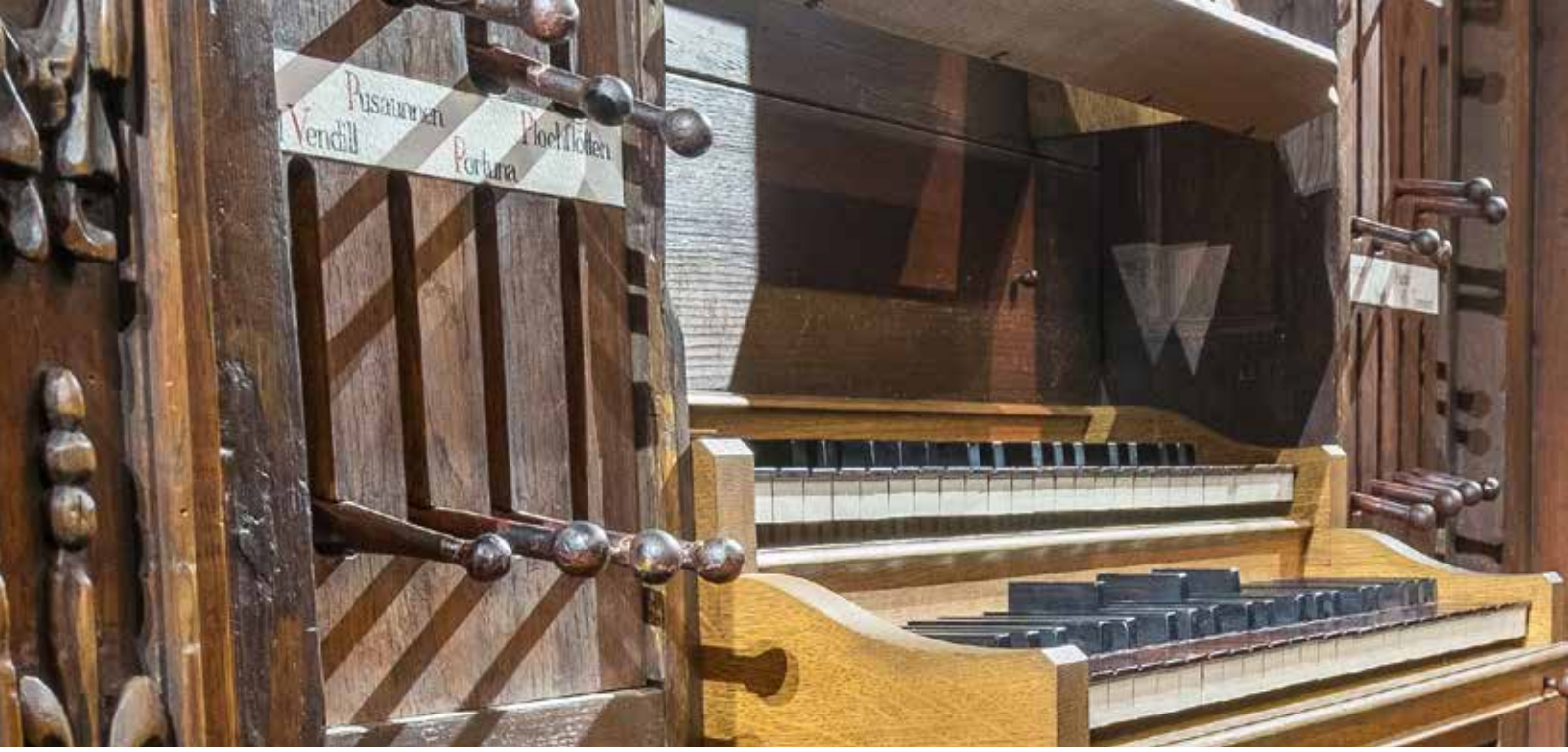
The Wöckherl organ (1642) of the Franziskanerkirche Vienna (with split sharps for q#0/ab0, d#1/eb1 und q#1/ab1)